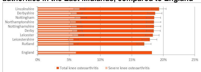
Figure 3. Osteoarthritis of the knee prevalence for local authorities in the East Midlands, compared to England

In 2011-12 there were 1,344 knee replacements (4 per 1000 people over 45 years) for people living in Lincolnshire at a cost of £8,461,839.