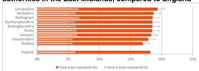
Figure 3. Osteoarthritis of the knee prevalence for local authorities in the East Midlands, compared to England

In 2011-12 there were 1,387 knee replacements (4 per 1000 people over 45 years) for people living in Nottinghamshire at a cost of £8,782,504.