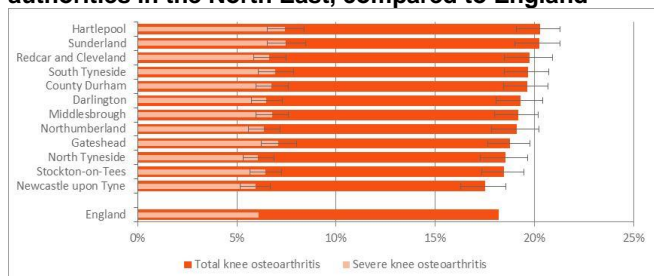
Figure 3. Osteoarthritis of the knee prevalence for local authorities in the North East, compared to England

In 2011-12 there were 355 knee replacements (4 per 1000 people over 45 years) for people living in North Tyneside at a cost of £2,216,941.