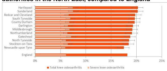
Figure 3. Osteoarthritis of the knee prevalence for local authorities in the North East, compared to England

In 2011-12 there were 380 knee replacements (4 per 1000 people over 45 years) for people living in Gateshead at a cost of £2,309,220.