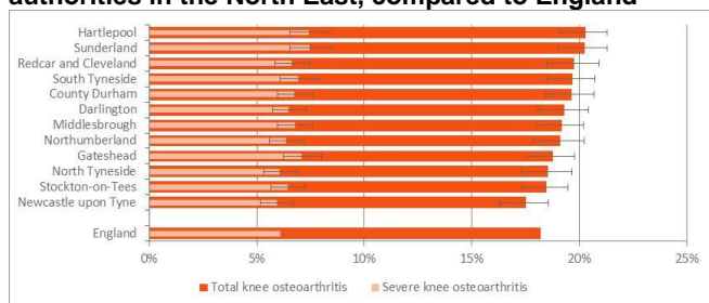
Figure 3. Osteoarthritis of the knee prevalence for local authorities in the North East, compared to England

In 2011-12 there were 194 knee replacements (3 per 1000 people over 45 years) for people living in Middlesbrough at a cost of £1,213,993.