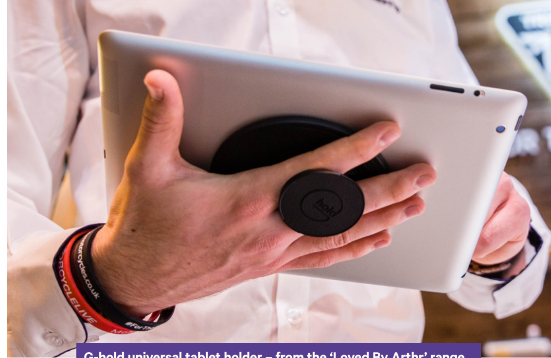
G-hold universal tablet holder – from the 'Loved By Arthr' range