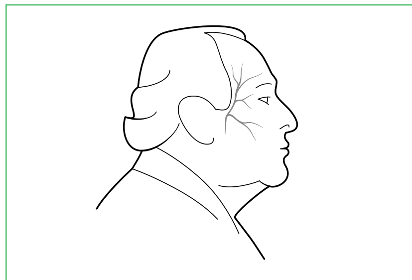
Figure 1. Profile of the head showing the temporal artery

These types of investigations are not yet available in all hospitals.